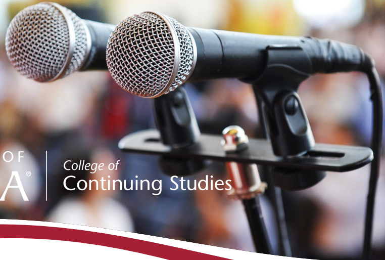
EXHIBIT AT OR SPONSOR